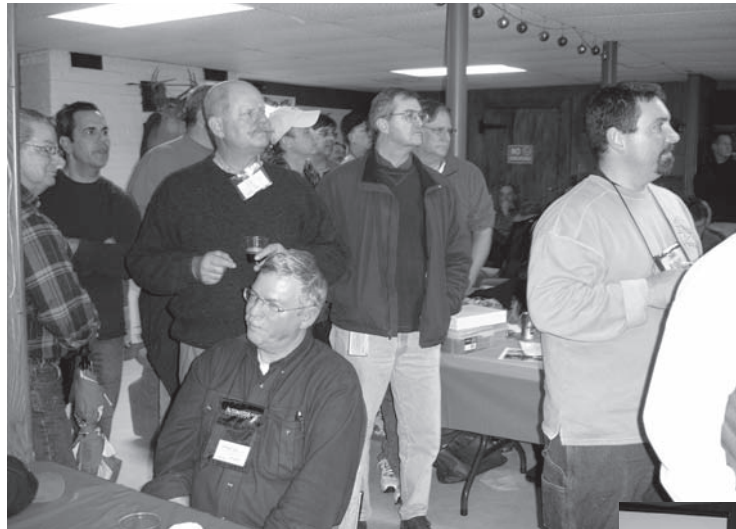
Paying attention to the proceedings.