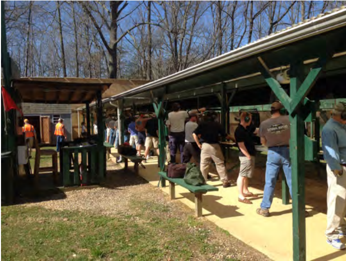
"A full line and good shooting – a great day!"

What a great first-ever Civilian EIC Tournament (CMP) at Anne Arundel Fish and Game! We had a nice attendance with 28 individual competitors, and able line officers that allowed the matches to run smoothly. There were 26 competitors for the inaugural East Coast .22 Rimfire Pistol EIC Match, providing three leg distinguished point awards, and 16 competitors for the Service Pistol EIC Match allowing two legs.