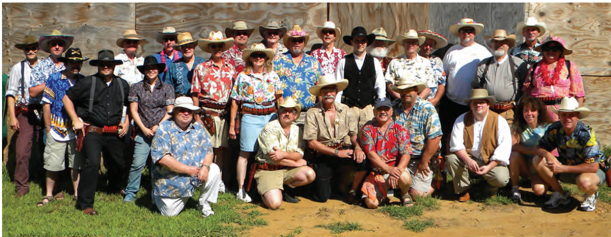
Cowboys on a cruise for the annual Hawaiian Shoot.