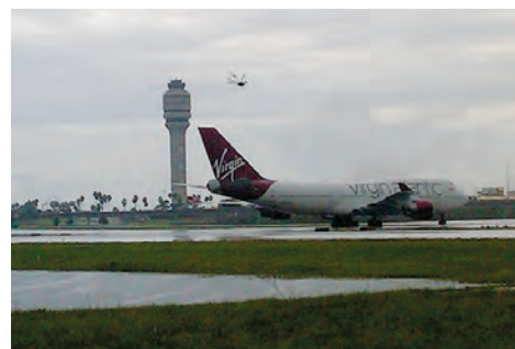
VA 747 at MCO with FL sandhill crane in flight

I was working with call them "ribeye in the sky." I guess if it flies, it dies down there. The second pic is a nest of what we believed were water moccasin eggs that we found while