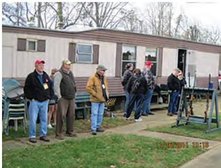
Members waiting their turn to shoot.