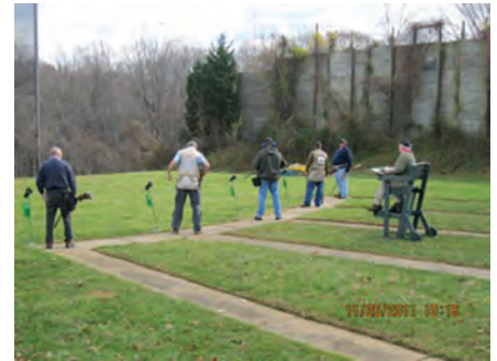
Our first group of Property Stewardship Committee shooters.