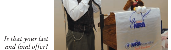
Is that your last and final offer?