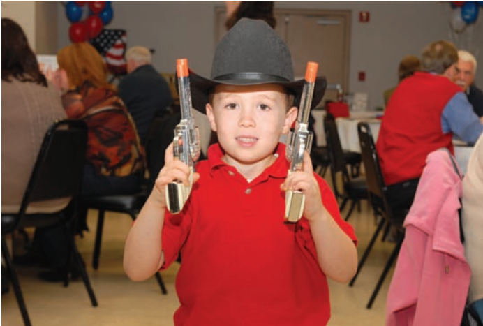
Open carry is ok at a FNRA event and you're never too young to start.