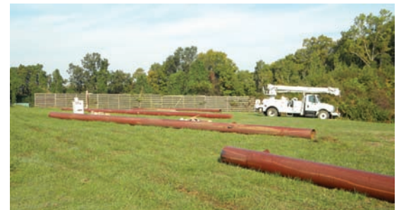
Start of construction on the shot curtain.