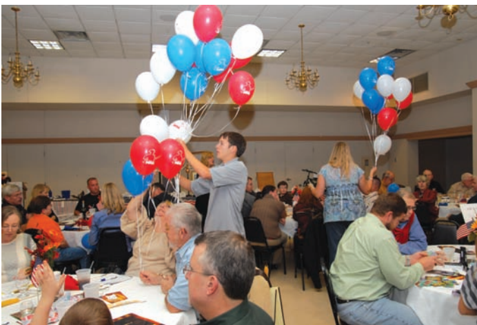
The popular balloon game gets under way.

I'd list everyone who helped but that takes a whole program at the dinner so you'll have to figure out who they are from the photos that make it into this issue. All of the photos will be available at the November meetings for your amusement.