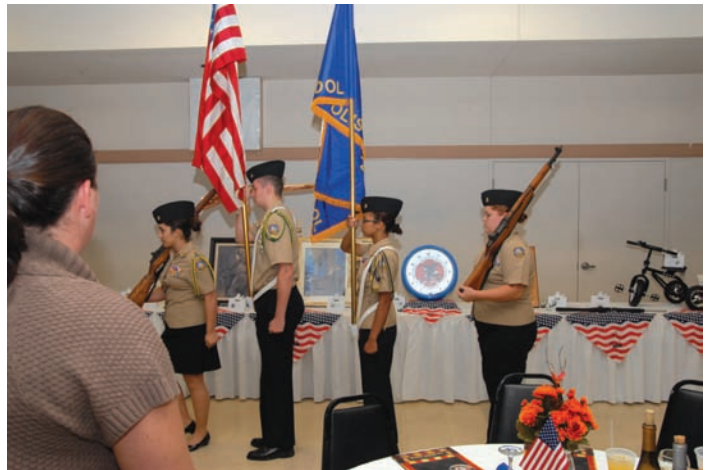
The Annapolis NJROTC Air Rifle Team Color Guard, a FNRA grant recipient, withdraws the colors after the Pledge of Allegiance.