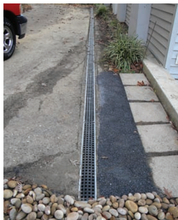
New channel drain to stop runoff from the parking lot.

Our new Channel drain is now installed and hopefully will stop the runoff from our parking lot and its resulting pool of water alongside our clubhouse. This should also stop the water seepage into our clubhouse meeting room. I have wrapped all three of our chimneys with tarps as a temporary fix to stop water from entering the clubhouse thru them until I can meet with the chimney people and decide what to do about the leaks and water seepage down thru them.